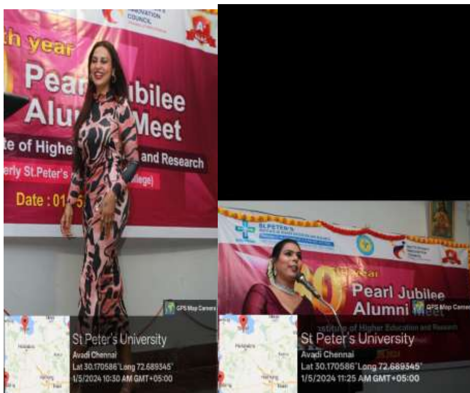
Our transgender alumni sharing an inspiring journey with the SPIHER community held on 01.05.2024