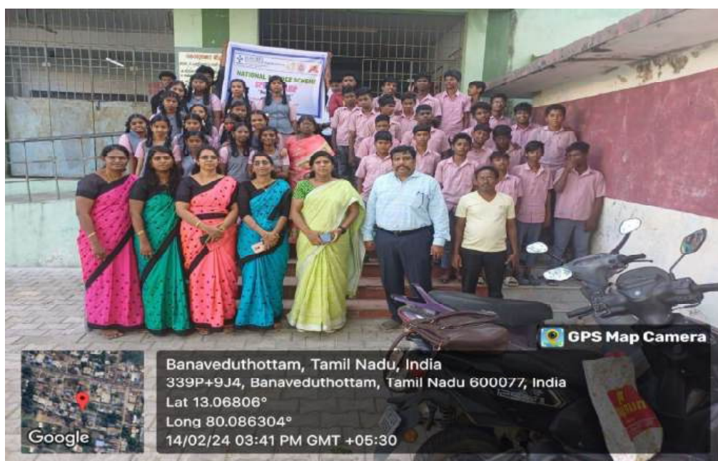
Educational Outreach Activity at Local School – Workshop on Electronics Mastery