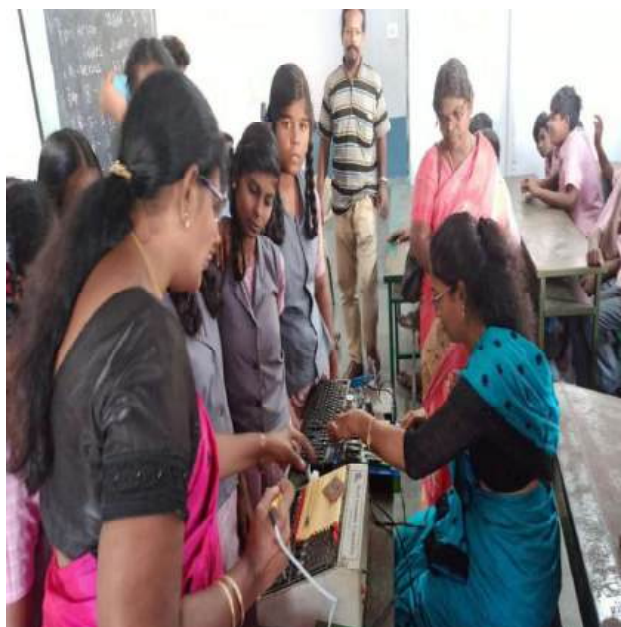
Educational Outreach Activity at Local School – Workshop on Electronics Mastery