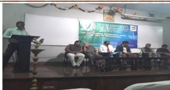
Workshop on Embedded system design using PIC microcontroller, February 22-23, 2017