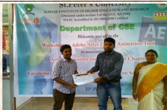
Hands on Training workshop on Adobe after effects animation tool, CSI student chapter activity, February 23, 2017