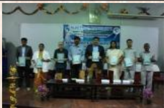
National Conference on Recent Trends in Computing and Communication Technologies (NCRCTCCT'17), March 28, 2017