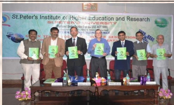
4th Intl. Conference on Green Technologies for Power Generation, Communication and Instrumentation, April 3-4, 2017