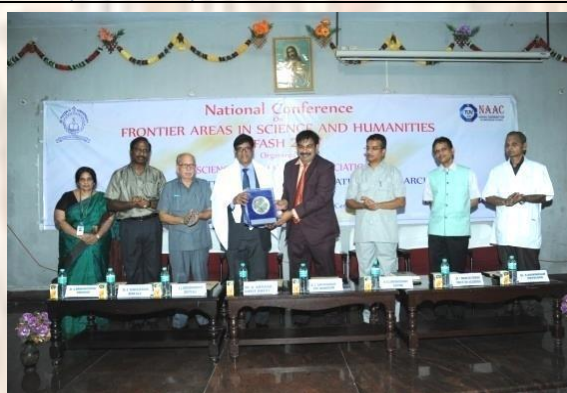
National conference on Frontier areas in science and humanities, May 8, 2017