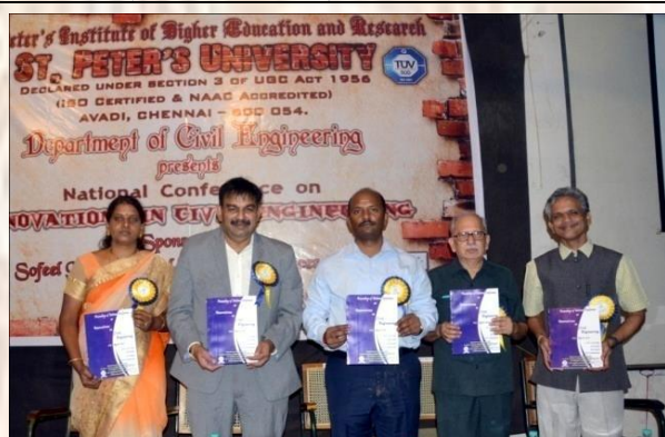
National Conference on Innovations in Civil Engineering, 21.03.2017