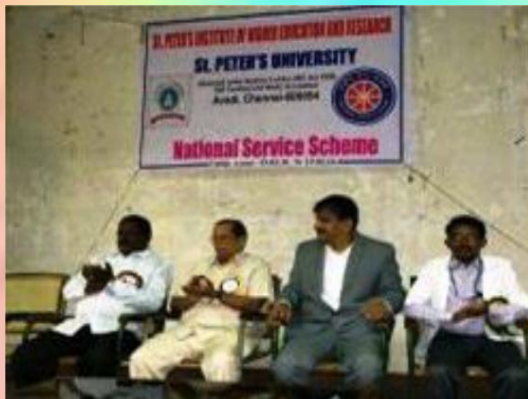
Inauguration of NSS camp