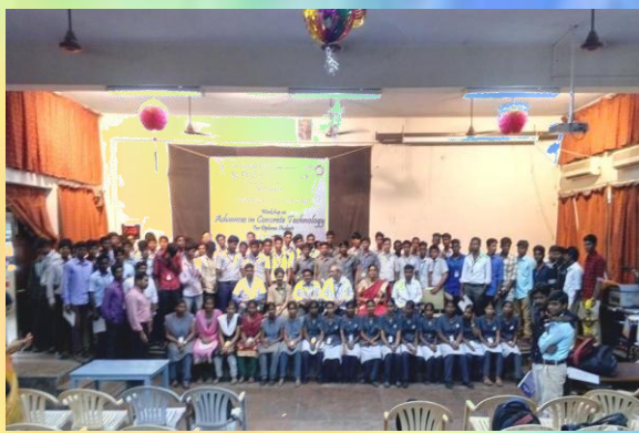
workshop on Advances in Concrete Technology, January 20, 2016