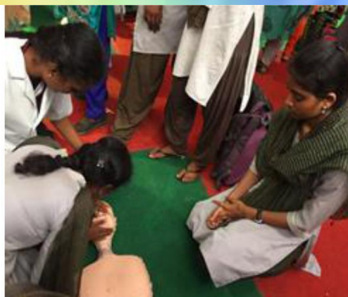
CPR) training for students