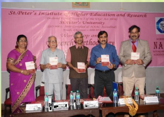
workshop on Research Methodology, January 19, 2016