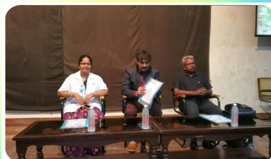
ED Cell activity 2016