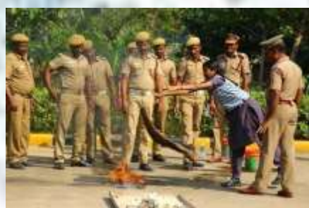
Training on fire safety to students