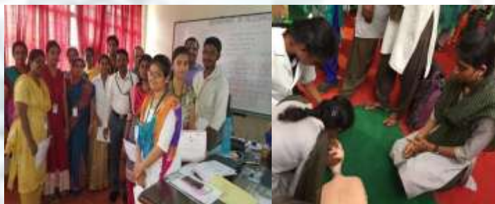
CRP Training & Practical session