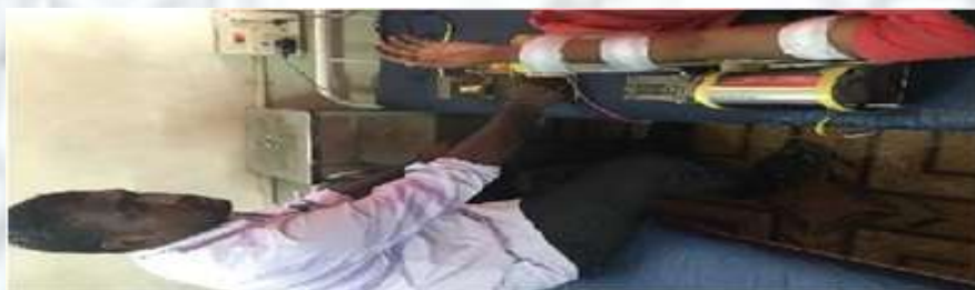
Device for active assist Rehaliablitation of elbow and wrist joint

The SPIHER – MSME Business Incubator is sponsored by the Ministry of Micro, Small and Medium Enterprises, Government of India. The following ten projects were completed successfully during the year with a total grant of Rs.51.552 lakhs. Patent was filed on the Device for hand gesture to voice translation dumb assist device