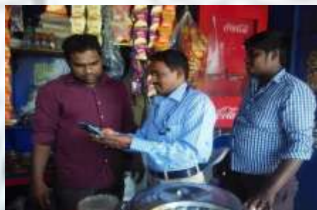
Digital payment campaign

The NSS Unit along with IQAC cell conducted several programmes during the academic year.