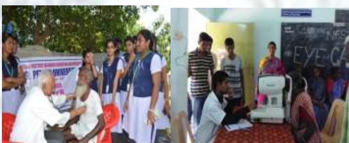
Health camp in Konambedu Village Eye camp in school