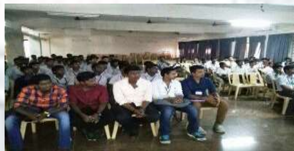
Inauguration of NSS activities for 2016-17