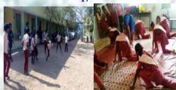
Games & Yoga Class for School Students