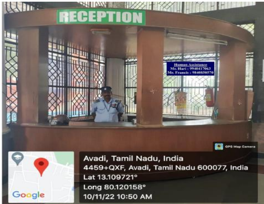
Security Gate at the Entrance