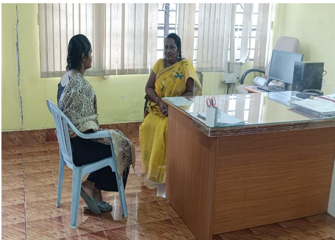
Counselling session for the girls students